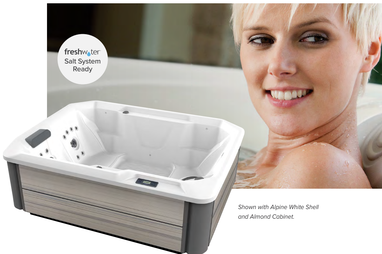
Shown with Alpine White Shell and Almond Cabinet.