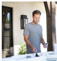
FreshWater® Salt System Ready