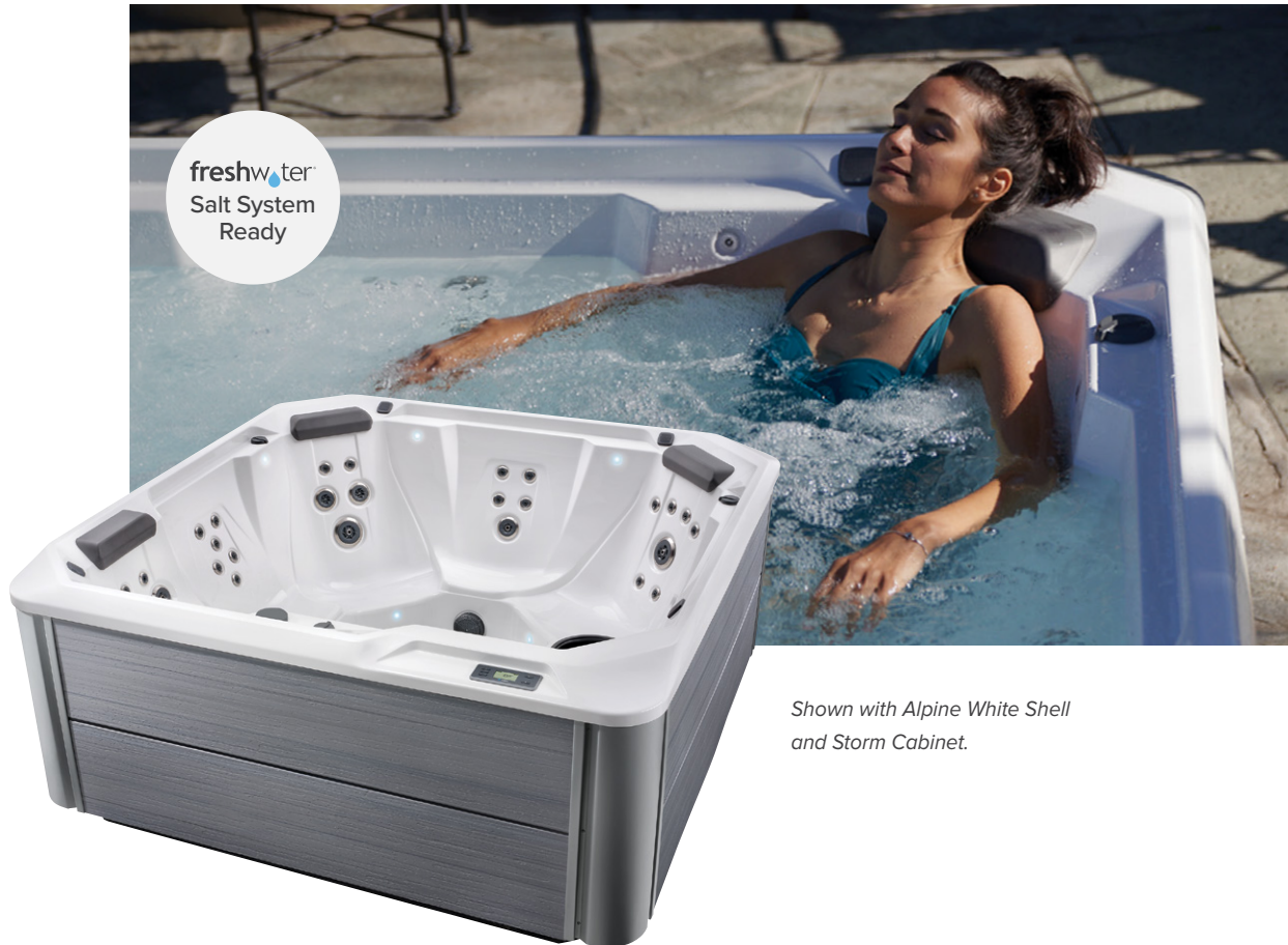
Shown with Alpine White Shell and Storm Cabinet.