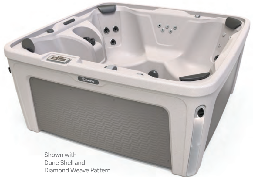
Shown with Dune Shell and Diamond Weave Pattern