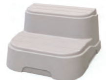
Available in Brown or Grey