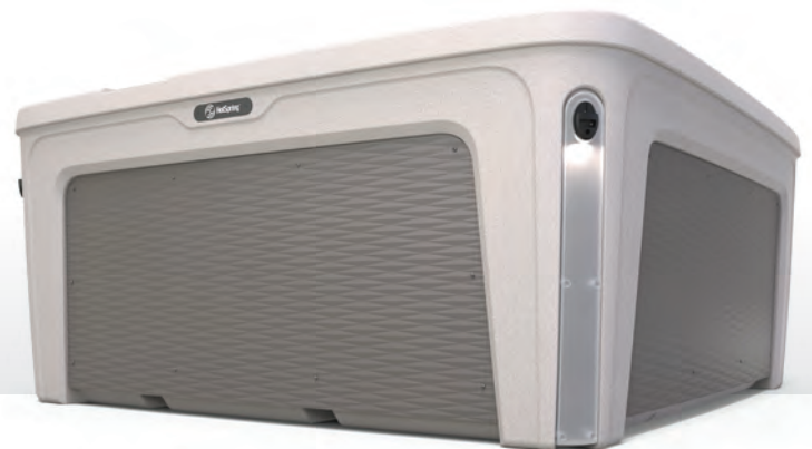
Dune with Diamond Weave