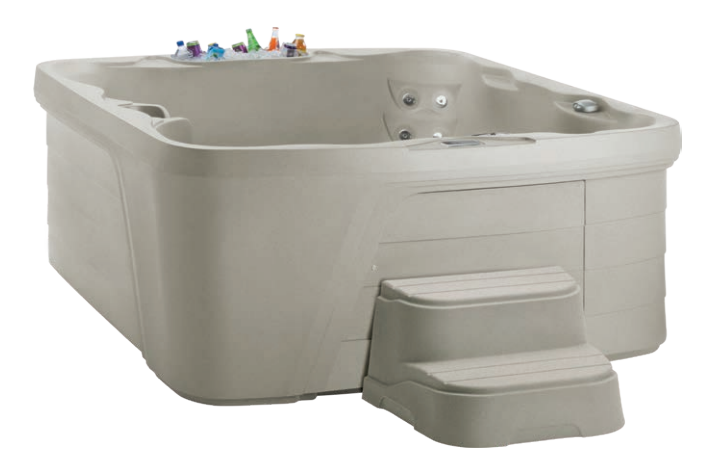
Monterey shown in Sand with built-in ice bucket