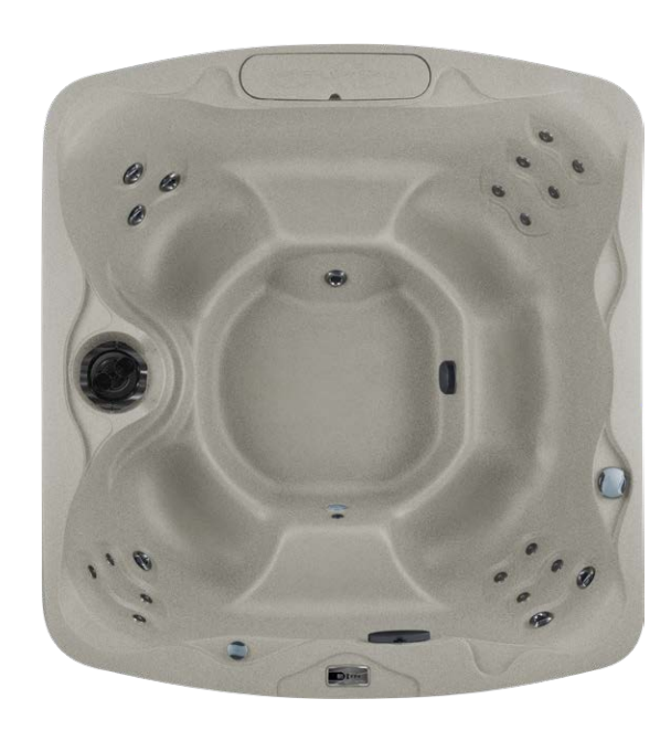
Monterey shown in Sand