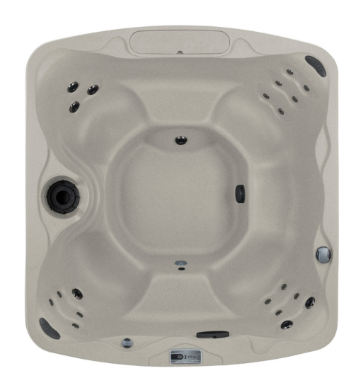
Monterey shown in Sand