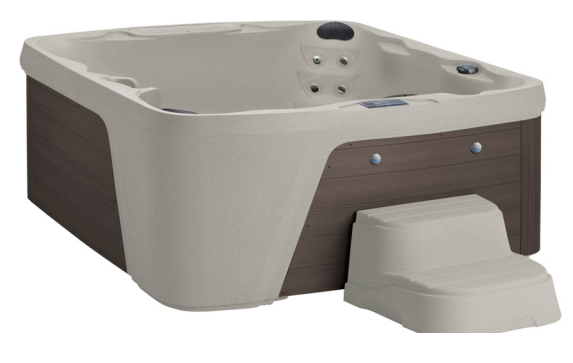
Monterey shown in Sand / Brown with built-in ice bucket