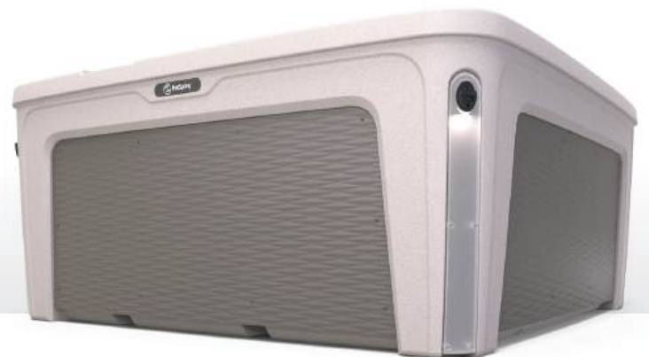
Dune with Diamond Weave