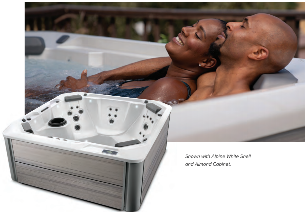
Shown with Alpine White Shell and Almond Cabinet.