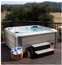
FreshWater™ Salt System Ready