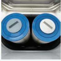
Dual Action Filtration SilentFlo Circulation