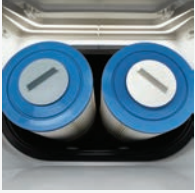
Dual Action Filtration SilentFlo Circulation