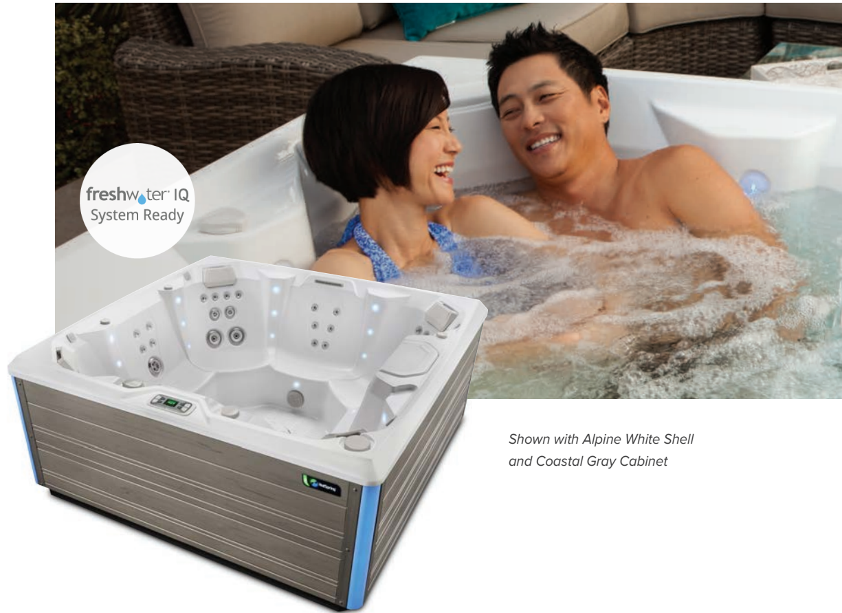
Shown with Alpine White Shell and Coastal Gray Cabinet

People Seating Jets Voltage 7 Seats Open 49 Jets 230 V