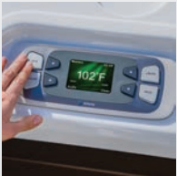
Color LCD Display