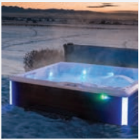
FiberCor® High-Density Insulation