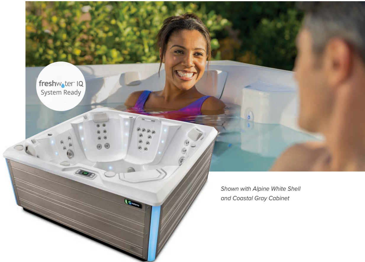
Shown with Alpine White Shell and Coastal Gray Cabinet

People Seating Jets Voltage 7 Seats Open 41 Jets 230 V