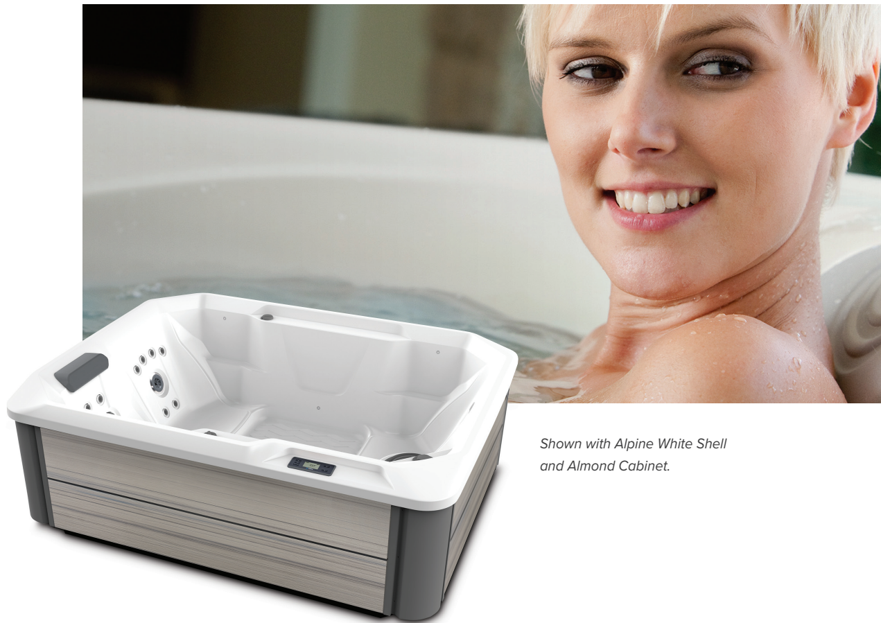
Shown with Alpine White Shell and Almond Cabinet.