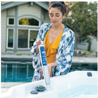
Frog® In-Line Cartridge Ready