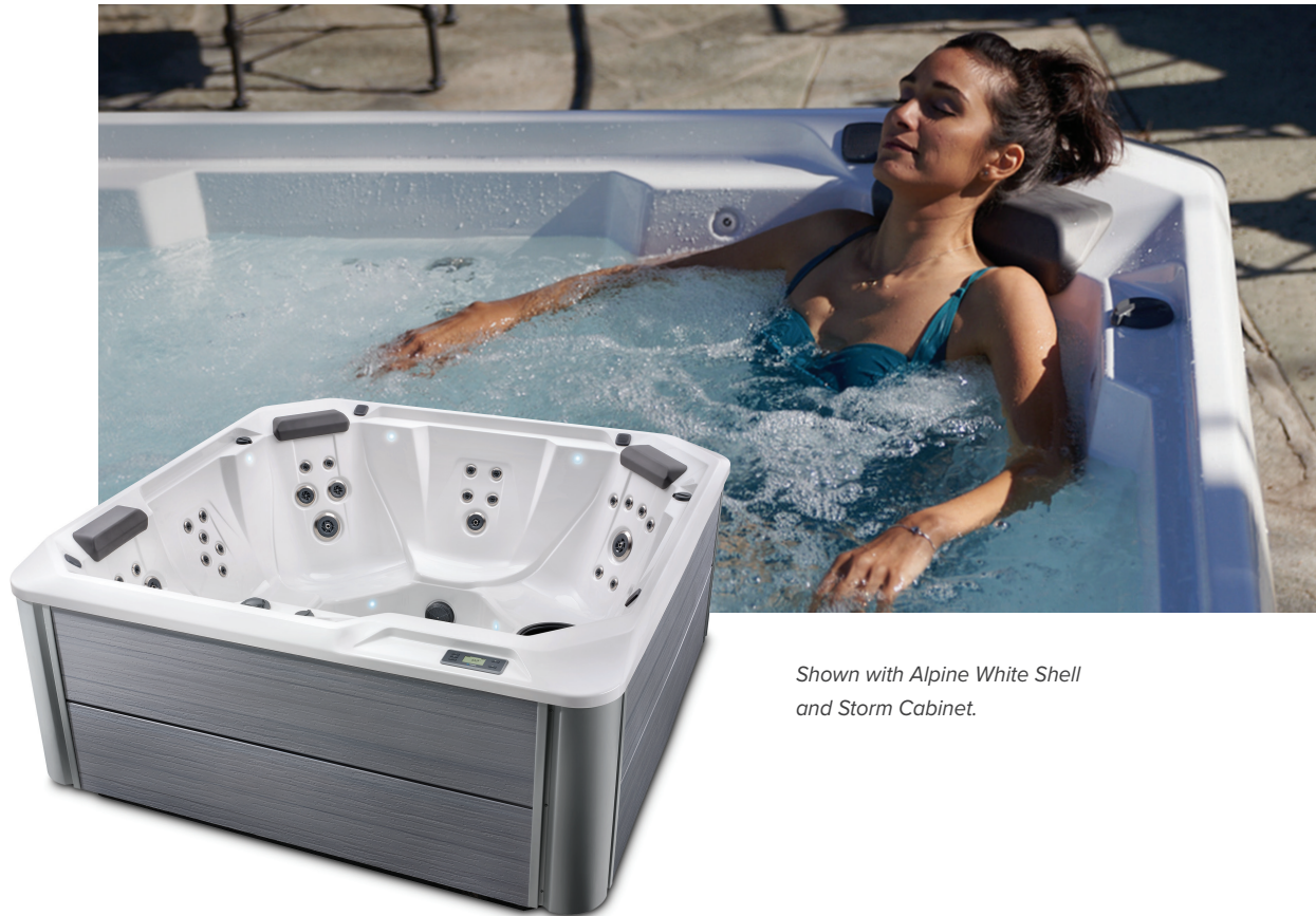
Shown with Alpine White Shell and Storm Cabinet.