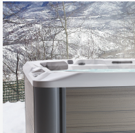
FiberCor® High-Density Insulation