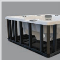
Polymer Substructure & Base Pan