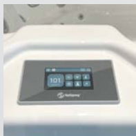
Color LCD Touchscreen