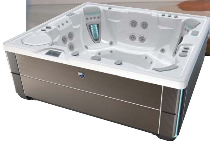
Shown with Alpine White Shell and Java Cabinet

People Seating Jets Voltage 7 Seats Open 49 Jets 230 V