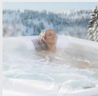
Super Energy Efficient